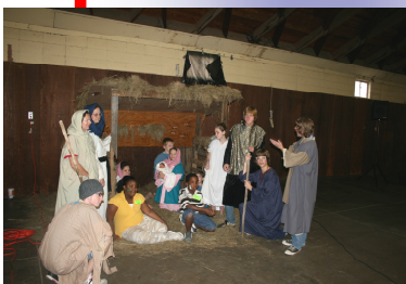
Four Booths From Dec 08 Festival