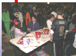
Some Booths From Happy Birthday Jesus '09