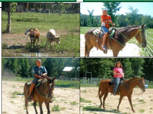
Enjoying Sanctuary Ranch before school starts!