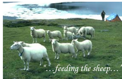
"...feeding the sheep..."

E-Mail: wwwjdcaw@aol.com Web Site & Blog: www.wingardhome.org